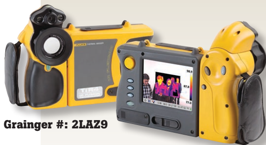
Grainger #: 2LAZ9