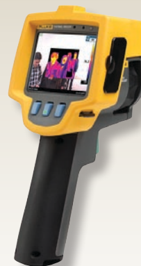
Grainger #: 2LAZ6