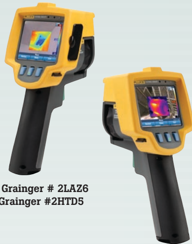
TiR1: Grainger # 2LAZ6 TiR: Grainger #2HTD5