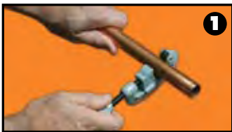
1 Cut pipe