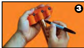
3 Mark pipe