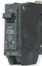
Circuit Breaker Bolt On, 20A GE No. 3HXR6