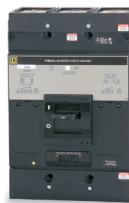
MAL Circuit Breaker SQUARE D No. 5B930 ✓