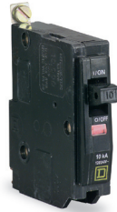
Circuit Breaker QOB Bolt On, 20A SQUARE D No. 1H824