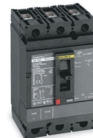
Circuit Breaker Lug In/Lug Out SQUARE D No. 1MAV4 ✓