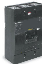
Motor Circuit Protector MAG-GUARD No. 2JXA2 ✓