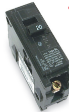
Circuit Breaker Bolt On, 20A SIEMENS No. 3CMY1